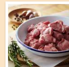
Diced lamb shoulder