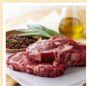
Beef scotch fillet steak