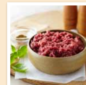
Beef or lamb mince