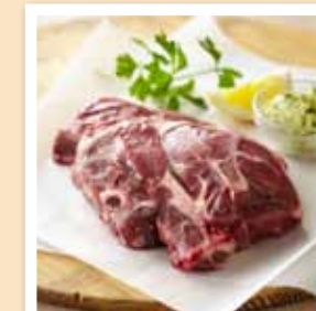
Lamb shoulder chops

The following cuts work well in this recipe.