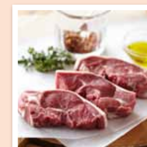
Lamb leg steaks