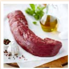
Beef eye fillet