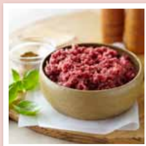
Beef or lamb mince

The following cut will work well in this recipe.