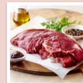
Beef rump steak