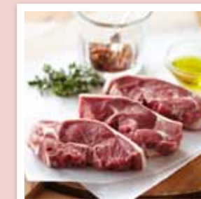
Lamb leg steak