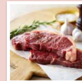
Beef sirloin steak

The following cuts work well in this recipe.