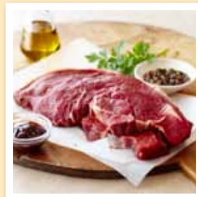
Beef rump steak

The following cuts work well in this recipe. See recipes.co.nz for cooking times.