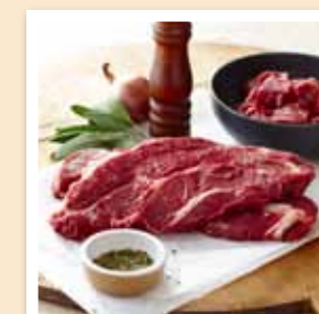
Beef chuck steak

The following cuts work well in this recipe.