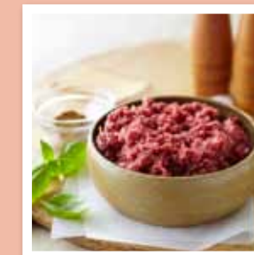
Beef or lamb mince

The following cut will work well in this recipe.