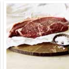
Beef rump steaks