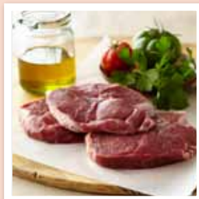
Lamb leg steaks

The following cuts work well in this recipe.