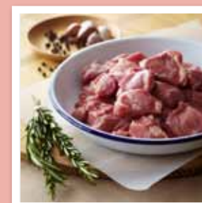
Lean diced lamb