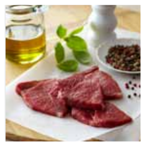
Beef minute steaks