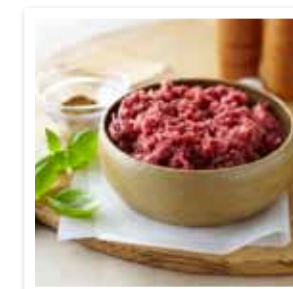
Beef or lamb mince

The following cut will work well in this recipe.