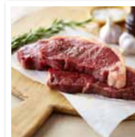
Beef sirloin steaks

The following cuts work well in this recipe