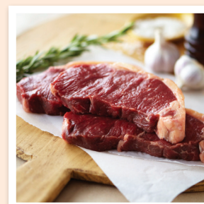
Quality Mark sirloin steak

The following cuts also work well in this recipe.