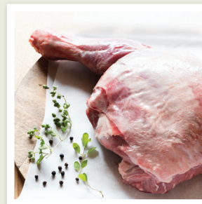
Quality Mark boned lamb shoulder

The following cut also works well in this recipe.