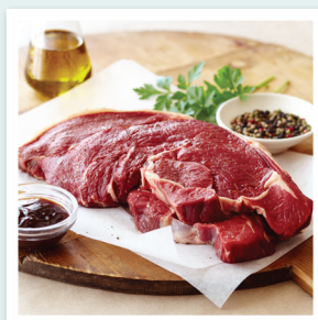
Quality Mark rump steak

The following cuts also work well in this recipe.