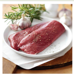
Quality Mark lamb backstrap

The following cuts also work well in this recipe.