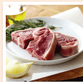
Quality Mark lamb loin chops

The following cuts also work well in this recipe.