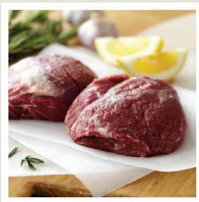
Quality Mark lamb rump

The following cuts also work well in this recipe.