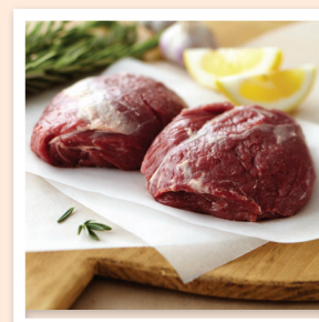
Quality Mark lamb rump