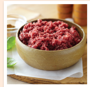
Quality Mark beef or lamb mince