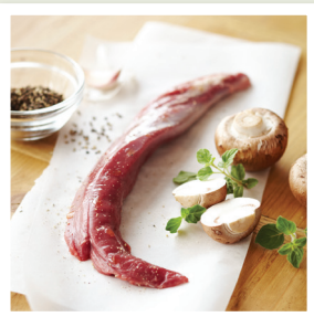
Quality Mark lamb fillet