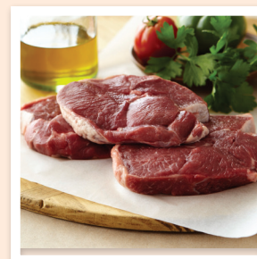
Quality Mark lamb leg steaks

The following cuts also work well in this recipe.