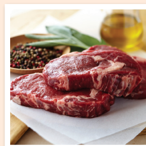
Quality Mark scotch fillet steak

The following cuts also work well in this recipe.