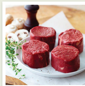
Quality Mark eye fillet steak