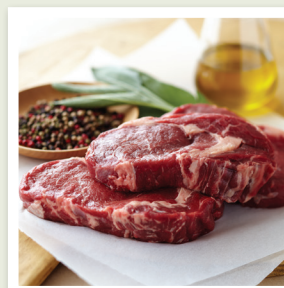
Quality Mark scotch fillet

The following cuts also work well in this recipe.