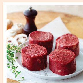
Quality Mark eye fillet steak