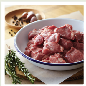
Quality Mark diced lamb shoulder, leg or rump