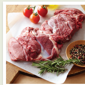
Quality Mark butterflied lamb leg

The following cut also works well in this recipe.