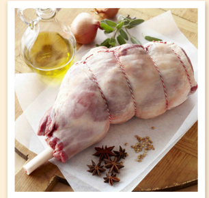
Lamb leg - carvery

The following cuts also work well in this recipe. Refer to recipes.co.nz for cooking times.