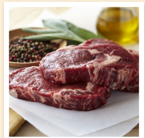
Beef scotch steaks