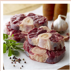
Beef shin on the bone

The following cut also works well in this recipe.