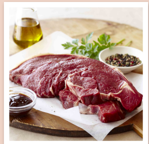
Beef rump steaks

The following cuts also work well in this recipe.