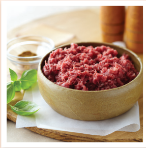
Lamb or beef mince