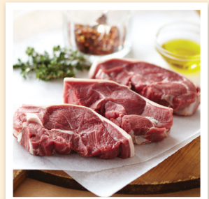
Lamb leg steaks

The following cuts also work well in this recipe.