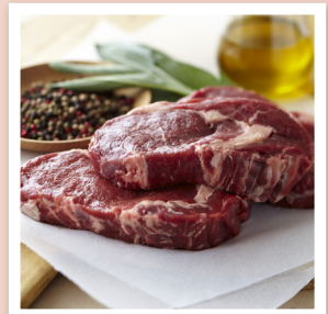
Beef scotch steaks