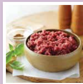
Beef or lamb mince

The following cuts work well in this recipe.