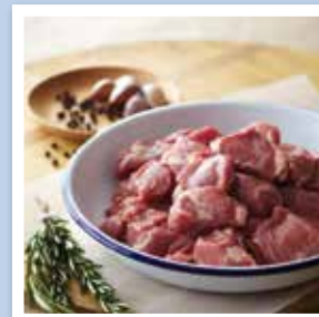
Diced lamb shoulder

The following cuts work well in this recipe.