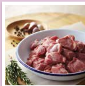
Diced lamb shoulder