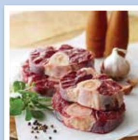
Beef shin (remove bones before adding potato top)