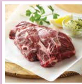
Lamb shoulder chops