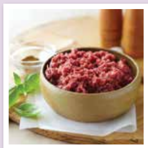
Beef or lamb mince

The following cuts work well in this recipe.