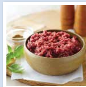
Lamb or beef mince

The following cuts work well in this recipe.