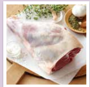
Lamb leg, bone in