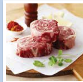
Lamb neck chops (use 1kg)