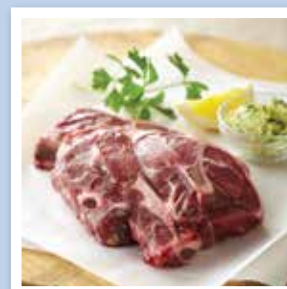
Lamb shoulder chops (use 1kg)