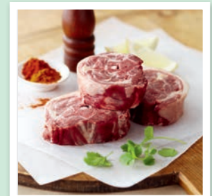
Lamb neck chops