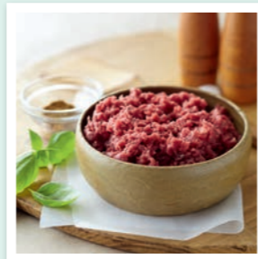
Beef or lamb mince

The following cut will work well in this recipe.