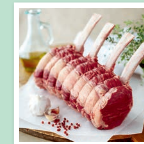
Whole beef rib eye

The following cuts work well in this recipe. See recipes.co.nz for cooking times.