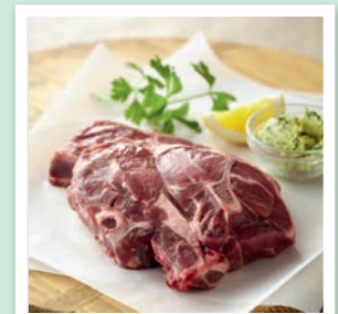
Lamb shoulder chops

The following cuts work well in this recipe.