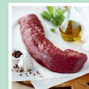
Whole beef eye fillet