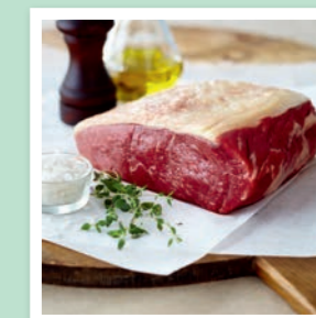
Whole beef sirloin