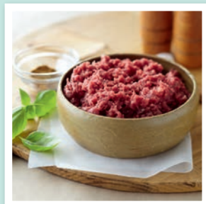
Beef or lamb mince

The following cut will work well in this recipe.