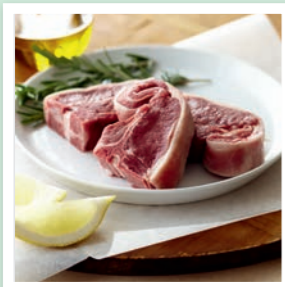
Lamb loin chops