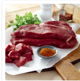
Beef blade steak